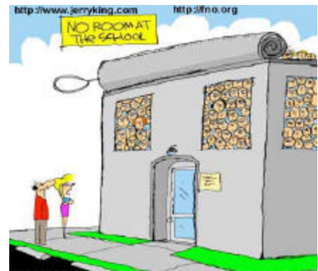
"They said we could move our kids to this so-called good school, but they squeezed 'em in so tight, it's like sardines in a can! How's that going to improve learning?"

For those without computer access, contact Dot McLane 215-362-3805 for information about offering a program on the NCLB Act.