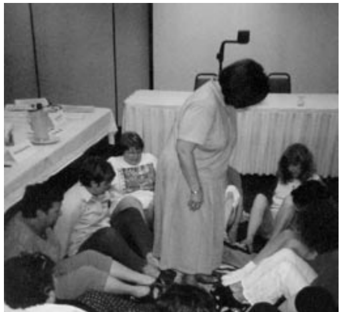
PA AAUW Board members encounter and successfully overcome several team-building challenges at Summer Meeting